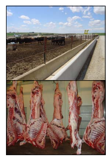
The Mississippi Farm to Feedlot Program provides statewide benchmarks for comparing calf feedlot performance, carcass merit, and finishing economics

"... The amount of time and effort to maintain and provide the records and paperwork necessary to achieve age verification premiums is more than offset by the potential monetary gains."