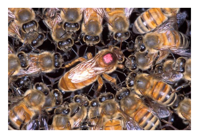
Figure 2. A well mated queen produces pheromones that attract a worker court, stimulate comb production, and inhibit queen rearing and worker ovary development. All of these processes help sustain basic colony order and function.

Finally, the total number of drones (avg. 18.2 \pm 4.8 ) that had mated with each queen was not significantly different among queen producers. Thus, the overall conclusion is that despite significant variation in the size of queens from different producers, the mating success of queens among the different producers was similar.