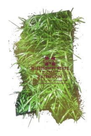
Find Your Place in the World of Forages at Mississippi State University

For upcoming forage related events visit: http://forages.pss.msstate.edu/events.html