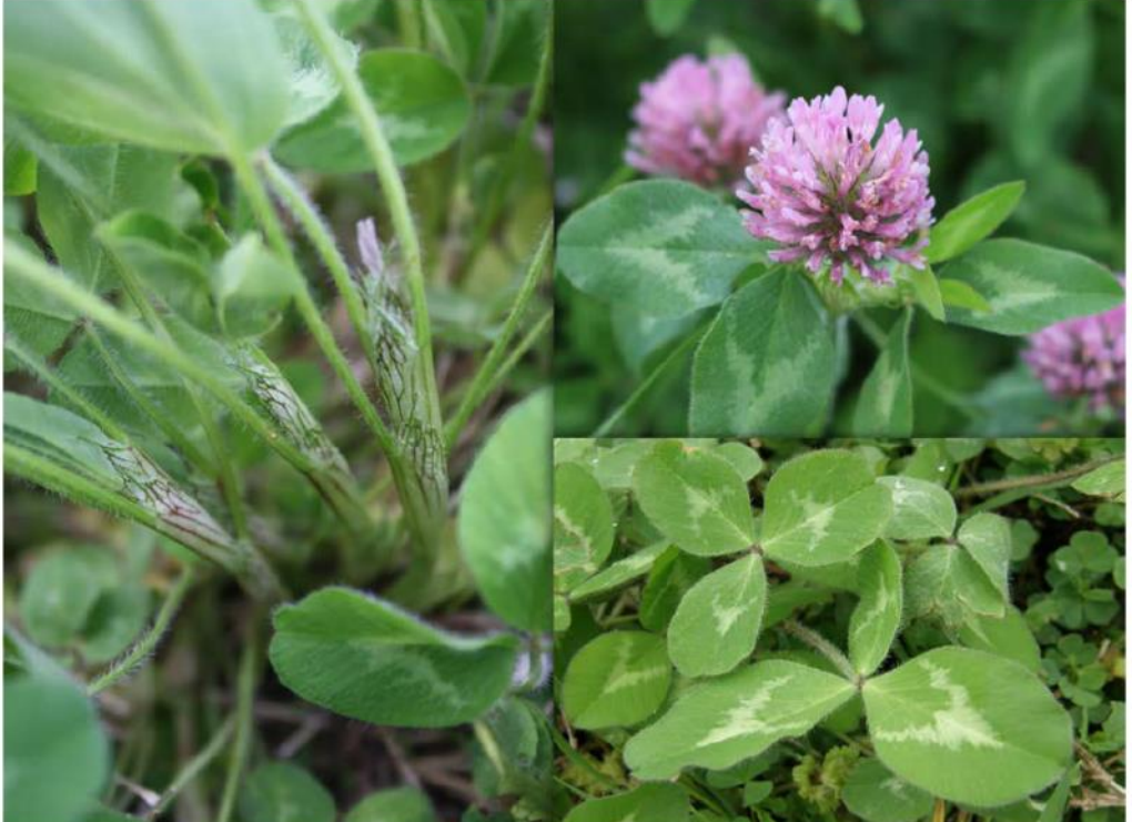
Red clover has hairy hollow stems and leaves. The alternate leaf is formed of three hairy oval leaflets marked with a light colored crescentic "V." The edge of the leaf blade is entire (has no teeth or lobes). At the base of the leaflets there is a white or light green chevron (sheet) and surround the area. Flowers are clustered into pinkish to violet heads.

White and red clovers producer higher quantities of protein than grasses. They also have the capacity to use and fix atmospheric nitrogen, thus eliminating the need for the application of commercial nitrogen sources. Although legumes can contribute to increase in grass/legume mixes while reducing N inputs, there is a misconception among producers that clovers that supply nitrogen