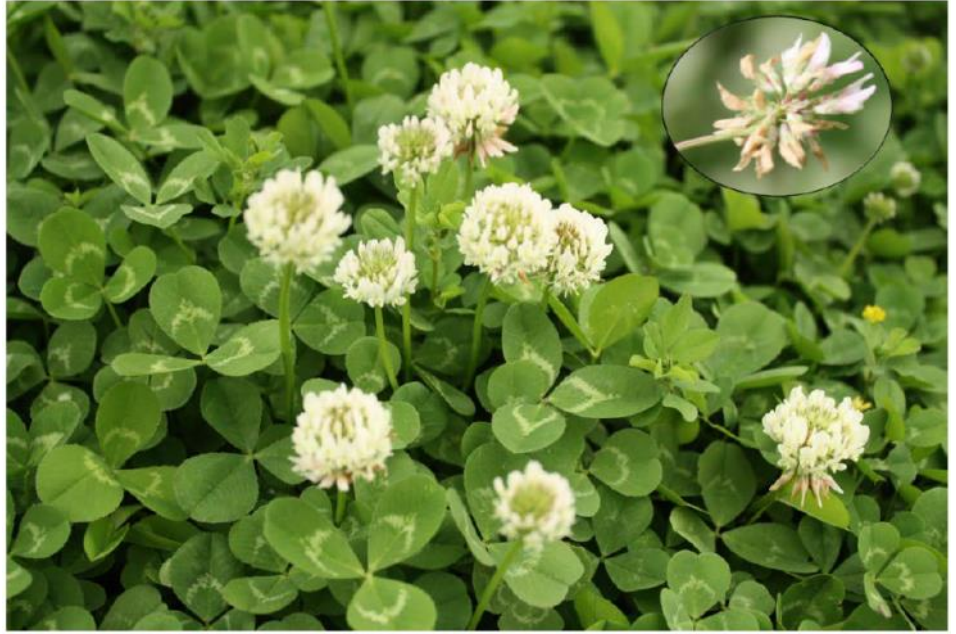
clover has larger seed heads than white clover has non-hairy true trifoliate oval leaves usually marked with a white or yellow "M" clover and a better seedling vigor. A good stand of red clover (30 to 40% of the grass/legume mix) can fix 100 to white or yellow "M" and seed is very small.

crowns and it is usually grouped by flowering type (early or late). There is no stolons or rhizomes and the plant develop a tap root the first year and secondary roots the second year. The early flowering red clover is also known as "medium red" and they are usually biennials with multiple cuts, but in the lower southern USA they act more as annuals. On the other hand, late flowering types (also known as "mammoth" or 'single-cut") tend to producer flowers in late spring and early summer and once they are harvested, they have little seasonal regrowth. Due to its short perenniality, natural reseeding is not sufficient to maintain stands and a good strategy may be reseeding with two to four pounds of seed per acre every two to four years to maintain the stand. Red clover and a better seedling vigor. A good stand of red clover (30 to 40% of the grass/legume mix) can fix 100 to 200 pounds of nitrogen per acre per