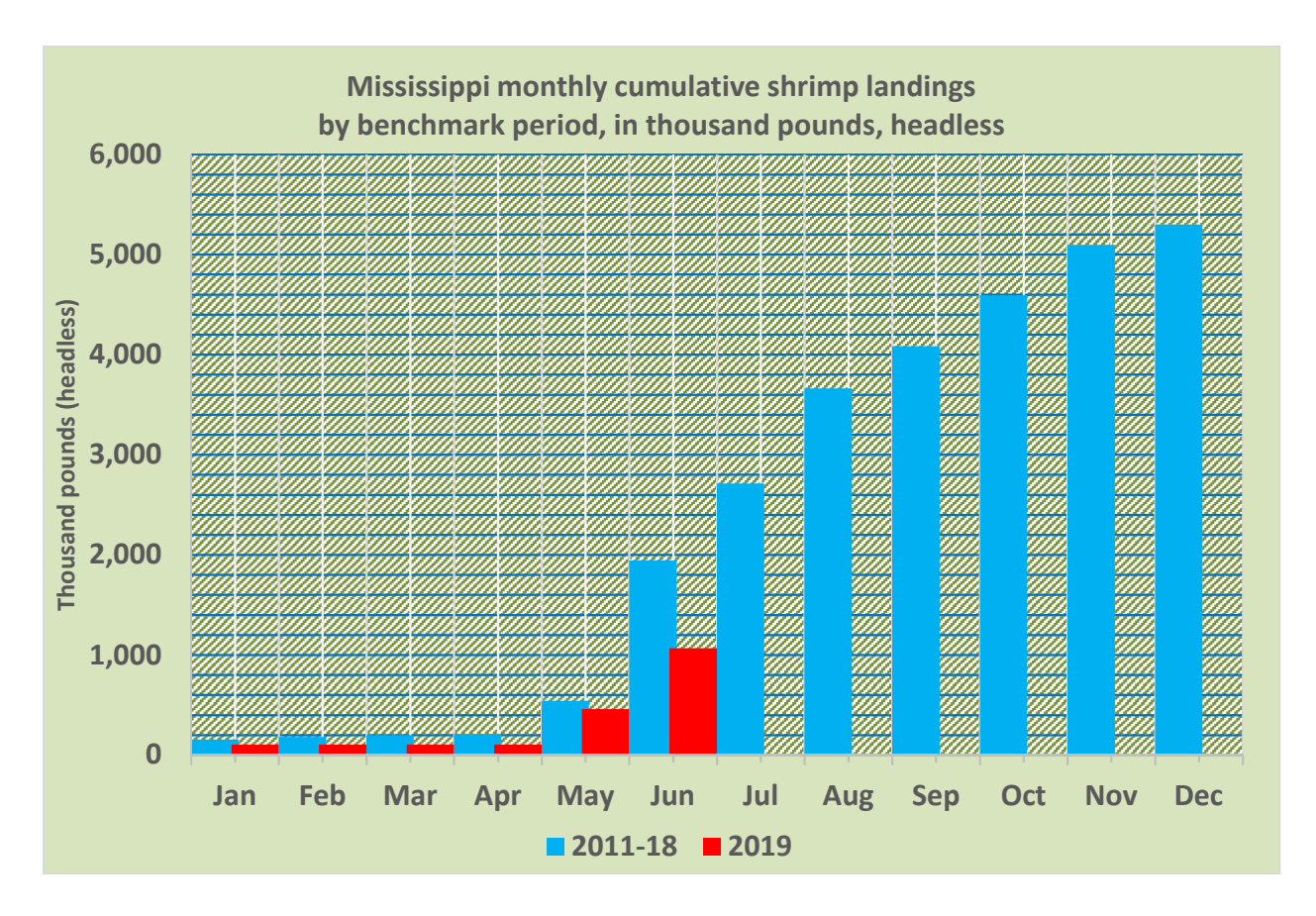
Figure 4. The vertical axis shows cumulative monthly commercial shrimp landings. Source of raw data: NOAA Fisheries.

The massive volumes of freshwater which were dumped into the fertile fishery grounds of the Mississippi Sound brought with them harmful freshwater algae which bloomed all over the coast. Beaches were closed, and advisories were in place until Labor Day weekend and maybe beyond.