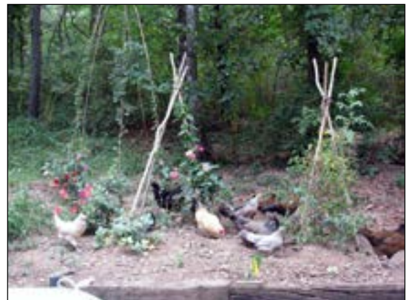
Backyard birds at work in the garden.