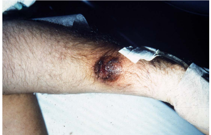
Brown recluse bite in the early stages of necrosis.

removal of damaged tissue. In some cases, the antibiotic dapsone has been used to treat these lesions. Whatever the case, brown recluse spider bites require a physician's care.