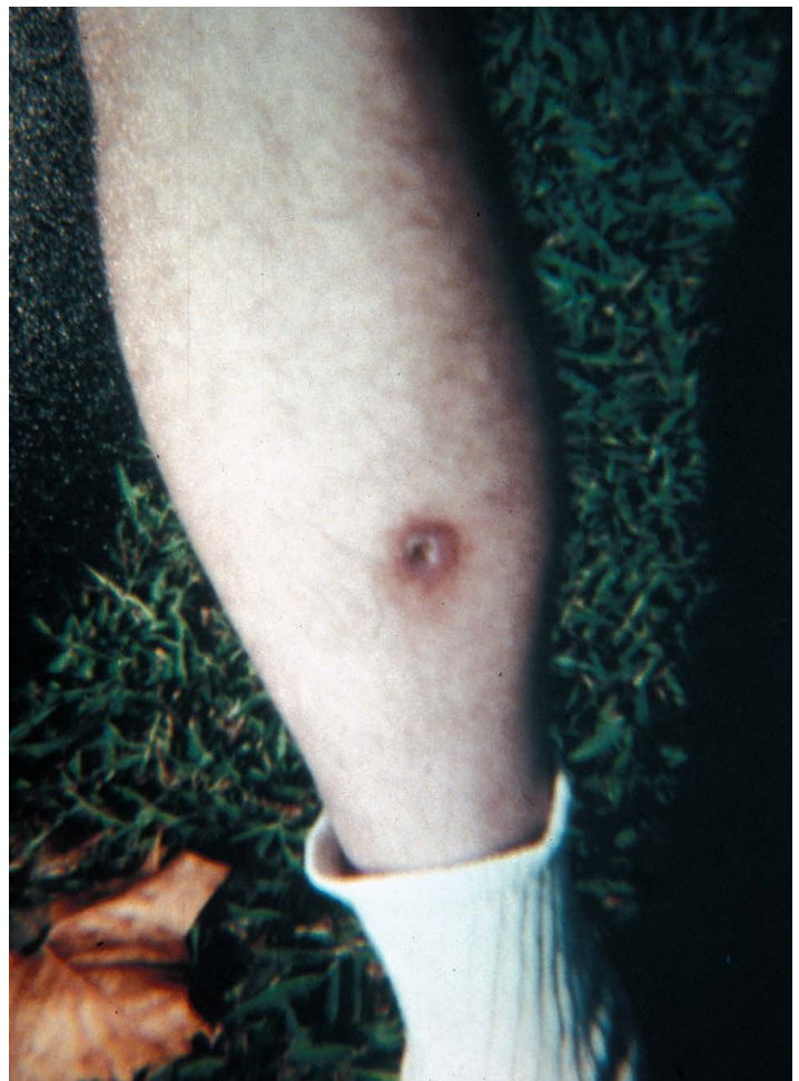
Brown recluse bite on leg 4 months after the bite.