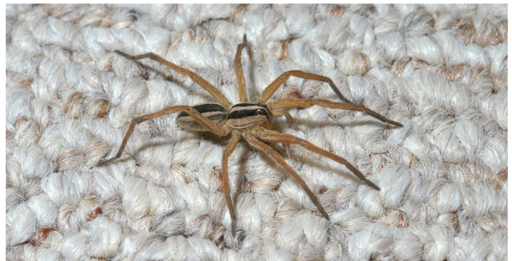
Some spiders, like this wolf spider, never build a web and use speed to catch their prey.

The brown recluse spins a rather nondescript web with threads that run in all directions. When fresh, the web is whitish in color, but, with time, it collects dust and becomes an off-white or grayish-white color. This structure is used as a resting site, retreat, or nursery—it is not used to catch prey.