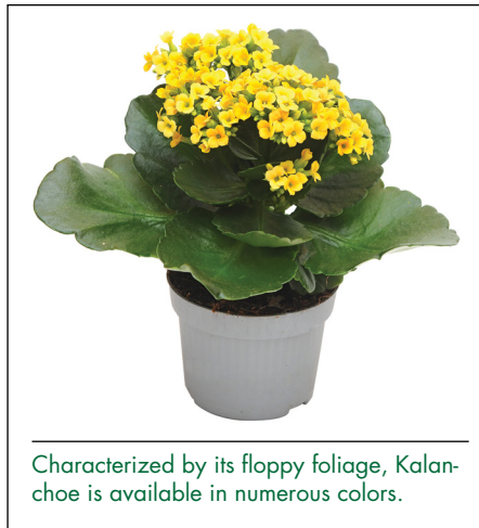
Characterized by its floppy foliage, Kalanchoe is available in numerous colors.

After the plant has flowered, cut the flower stems back to the second or third leaf below the old flowers. You may use a standard houseplant fertilizer every 2 to 4 weeks after new growth appears. Getting a kalanchoe to reflower can be tricky. To flower, the plant needs 14 hours per day of uninterrupted darkness for 8 weeks. A small amount of light (room lights, street lamps) during this 14 hours can keep it from flowering. Do not place a kalanchoe in a dark room that does not receive any light. The more light the plant receives during the short day, the faster it will flower. An easy way to provide uninterrupted darkness is to cover your plant with a box lined with a black plastic bag every day at 5 p.m. and uncover it the next day at 8 a.m.