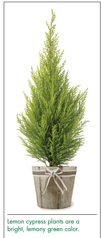
Lemon cypress plants are a bright, lemony green color.

Potted cypresses need sunlight and are used to bright, sunny locations outdoors. Their soil should be kept moist but not wet and should not be allowed to thoroughly dry. A good test is to insert your finger into the pot down to the first knuckle and then remove it. If soil particles adhere to your fingertip, the plant does not need water at that time. Lemon cypress can go outdoors and live as a containerized plant or be planted in the ground in USDA zones 7 to 10.