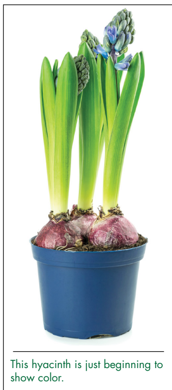
This hyacinth is just beginning to show color.

A decidedly fragrant flower, the hyacinth is appreciated by anyone who loves a breath of spring. Hyacinths are bulb plants, and their care is similar to that of tulips. You will enjoy a longer display of color if the plant is kept cool. Hyacinths are large, heavy-headed flowers bearing dozens of florets per bloom spike. Sometimes the weight of the flower head is so heavy, they need staking to keep upright. The color range of hyacinths includes white, pink, pale yellow, blue, and violet.