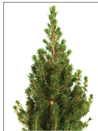
This Dwarf Alberta Spruce is a mini Christmas tree.

This spruce tree is often found in small pot sizes (6 to 8 inches) for use as a table-top Christmas tree. It grows in a cone shape and is characterized by a dense, fine, blue-green needles. Dwarf Alberta Spruce ( Picea glauca 'Conica') plants were discovered in Alberta, Canada. As such, they are acclimated to cool weather. They can grow outdoors in northern states to north Mississippi (zone 7).