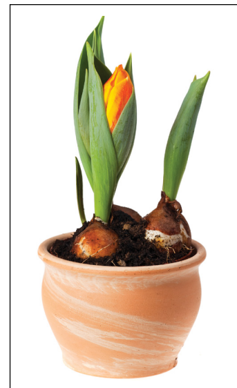
Potted tulips are best purchased in tight bud.

Tulips forced into bloom do not thrive when planted in the garden. Often, our deep Southern climate is too hot for them to be considered perennials, but we can enjoy them as garden annuals by planting the bulbs in the fall.