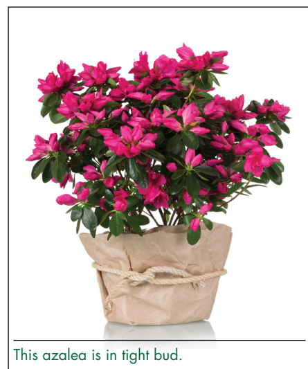
This azalea is in tight bud.

A colorful and eye-catching plant, the azalea should be kept in a location with bright light but not direct sun while in flower. Night temperatures between 55 and 60 degrees will prolong flowering. Keep the soil uniformly moist; never allow it to dry out completely.