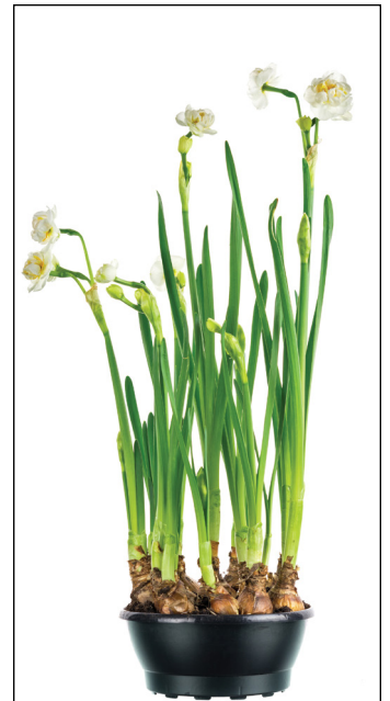
A double variety of paperwhite narcissus.

After the flowers have faded, move the plant to a location where the foliage receives sunlight and can naturally turn brown and dry. Some Mississippians have success planting the bulbs in gardens and enjoy the flowers year after year. But it is fine to discard bulbs after flowering.