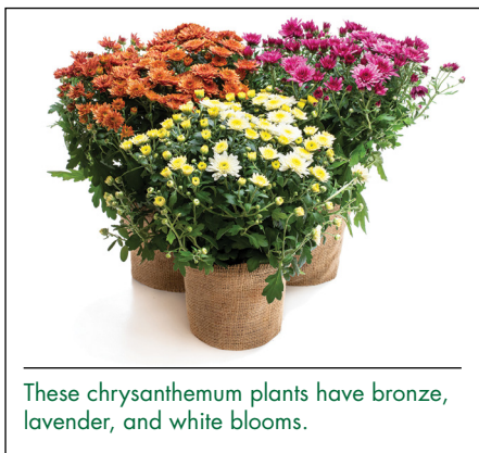
These chrysanthemum plants have bronze, lavender, and white blooms.

The National Chrysanthemum Society groups these plants by the forms of their blooms. There are 13 classes, which include flowers resembling anemones, flowers with spoon-shaped petals and quills, and flowers with petals that curve in or reflex outward. Mums will keep their colorful blooms longer if they are kept in bright light and cool temperatures.