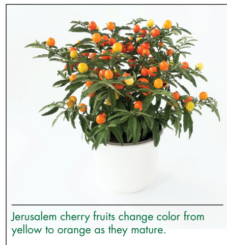
Jerusalem cherry fruits change color from yellow to orange as they mature.

As a houseplant, Jerusalem cherry requires bright light or full sun to thrive. Lack of humidity causes the plant to lose its leaves, blooms, or fruit. Keep the plant in a room with temperatures below 70 degrees. Higher temperatures may cause leaf, flower, or fruit drop. Fertilize the plant with a basic houseplant fertilizer while it is actively growing. Stop fertilizer treatment after the plant has finished blooming.