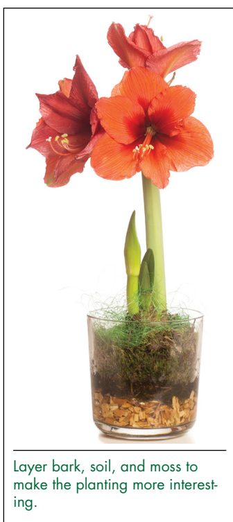
Layer bark, soil, and moss to make the planting more interesting.

Amaryllis is a popular indoor flowering plant in the winter and spring. It has large, showy blooms in colors ranging from white to shades of pink, salmon, red, and orange. It is the easiest bulb to bring into bloom, as it does not require precooling to flower like daffodils and tulips. If you cannot pot your new bulb immediately, keep it in a cool, dry location with good air circulation. Do not expose it to freezing, damp conditions. When ready to pot, use a container no larger than 1½ times the diameter of the bulb as it likes to be pot bound. Use a good potting mix, and sink the bulb up to the neck. Place in a warm, bright light situation, and water sparingly until the stem appears. As the bud and leaves appear, gradually water more. Do not overwater because this will cause the bulb to rot. It is not necessary to fertilize the plant during flowering.