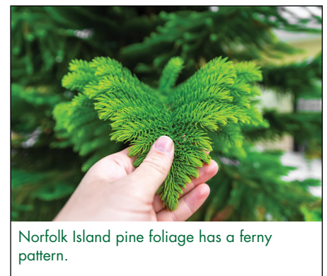
Norfolk Island pine foliage has a ferny pattern.

Norfolk Island pines prefer high to medium light (an east- or west-facing window) and cool day temperatures