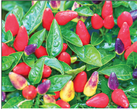
Ornamental pepper fruits display bright colors.

Whether inside or outside, ornamental peppers need full sun or bright light. Water them regularly, letting the soil dry between waterings. Plants remain more compact if the soil is kept on the dry side. Ornamental peppers do not like wet soil. Actively growing plants need light fertilization. While peppers are inside your home, keep them in a room that stays between 50 and 70 degrees. You can eat these peppers if they have not been treated with pesticides. They may be extremely hot and bitter.