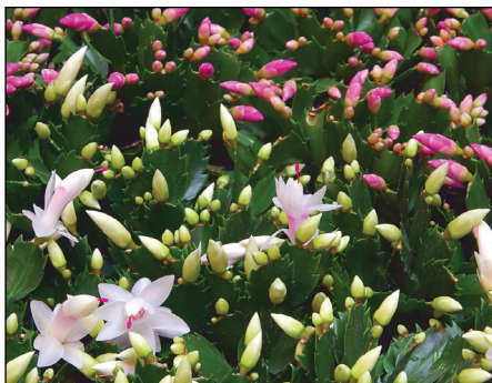
Schlumbergera flowers are beginning to open.

The main types of holiday cacti are Thanksgiving cactus ( Schlumbergera truncata ), Christmas cactus ( Schlumbergera x buckleyi ), and Easter cactus ( Hatiora gaertneri ).