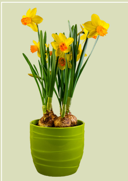
Figure 6. Larger bulbs like daffodils can be potted with the upper portion of the bulbs exposed.

Small bulbs can be completely covered with mix, but larger bulbs like daffodils, tulips, and hyacinths can be left with their tops exposed, particularly if your pot is small (Figure 6). Tulip bulbs should be placed so that the flat side of the bulb faces