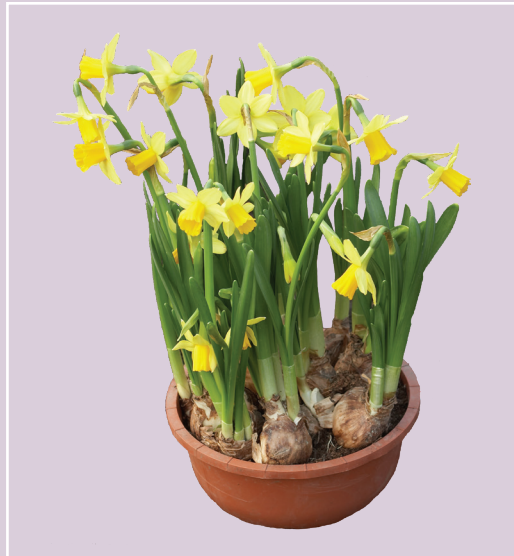
Figure 3. Daffodils are one of the easier bulbs to force into bloom.