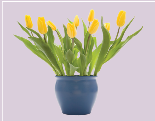
Figure 5. Varieties of tulips can be forced into bloom.