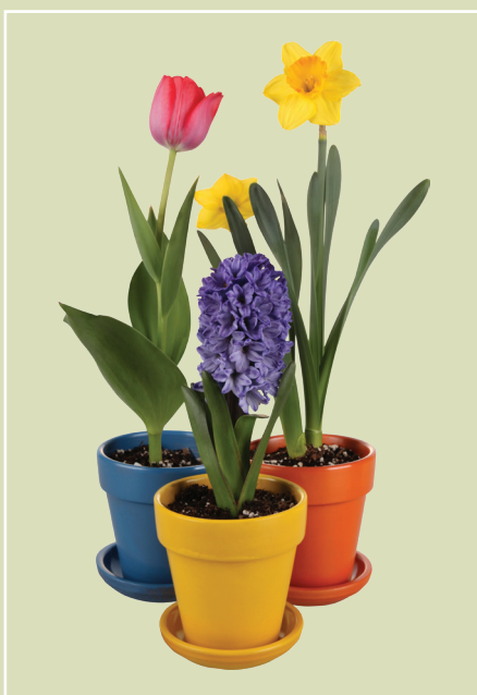
Figure 1. Forcing bulbs to flower out of season can add color and fragrance to the winter home.

Manipulating the environment to “trick” bulbs into thinking spring has arrived when it is still the middle of winter is a great project for all ages. The rewards will be the sights and scents of colorful, cheery spring flowering bulbs brightening the winter home while it is still cold and dreary outside. See Figure 1.