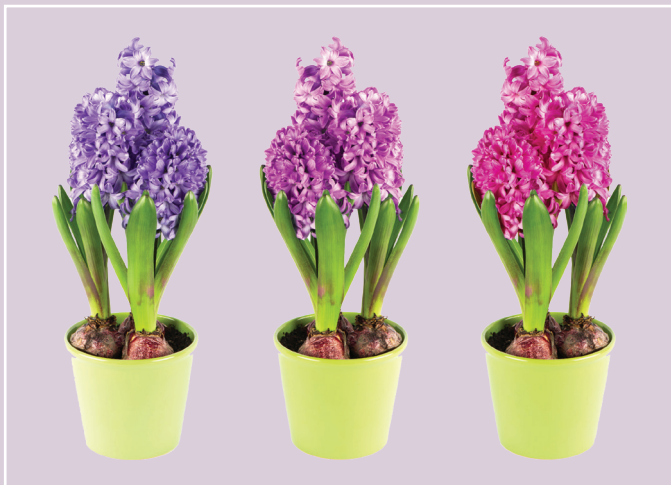
Figure 4. Hyacinths add color as well as fragrance to the home during the winter months.