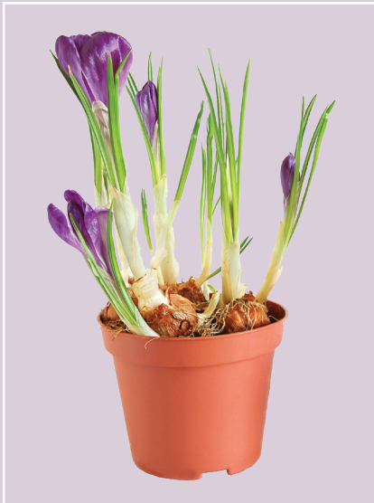
Figure 2. Crocus is a cold-hardy bulb that can be forced to bloom early.