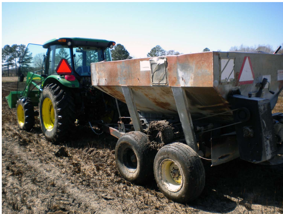
Figure 3. Managing soil fertility is essential for any crop production. Low soil pH can be corrected by applying lime before field establishment.

Leaving the dry, standing residue after the stand has matured can retain soil moisture, help cover the soil surface, and shade out germinating weed seeds between planted rows of switchgrass.