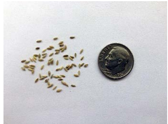
Figure 4. Switchgrass seed is extremely small ( \frac{1}{10} of an inch) and requires a planter with a small seed box and depth bands that prevent the seed from being planted too deeply.

Conventional planters, which require a prepared seedbed, can place the seed too deeply in loose soil, preventing germination and seedling development. However, if the seedbed is somewhat compacted, conventional planters can be used with a small seed box. Another planting method is broadcasting using a cone spreader. If this method is used, the seed should be mixed with a carrier, such as sand, lime,