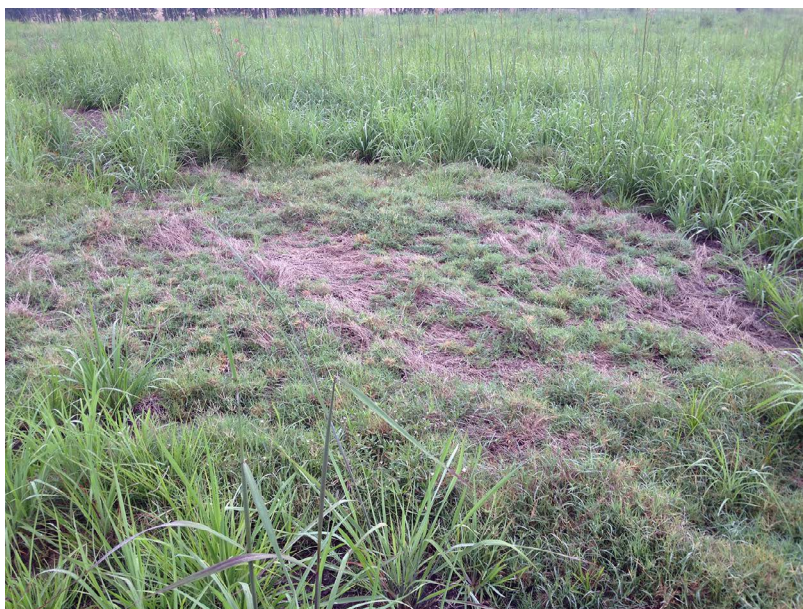
Figure 2. Uncontrolled sod grasses (like the bermudagrass pictured here) can eventually outcompete emerging switchgrass seedlings, robbing you of successful establishment.

One effective way to control weeds in advance is to plant an herbicide-resistant crop, such as corn or soybeans. This will require several applications of a broad-spectrum herbicide for weed control in the crop and will generate revenue on the site during the year of weed control. Cool-season forage crops, such as cereal rye, ryegrass, and oats can also be sown in the fall as a smother crop, reducing the competition of summer grasses and broadleaf weeds into the spring.