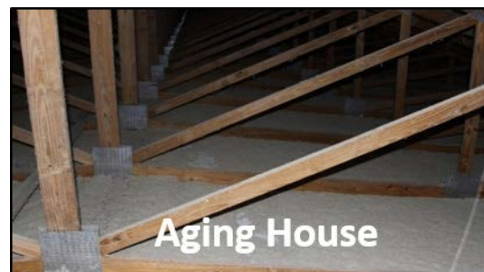
Figure 1. Blown cellulose is filled to the top of the truss’s bottom chord in this new house. In the aging house, the blown cellulose has settled several inches below the top of the bottom chord.