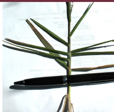
Figure 3. Individual plant.

Torpedograss ( Panicum repens L.) is a nonnative perennial grass native to Eurasia. It is considered one of the world's worst weeds. When fully mature, torpedograss can grow up to 3 feet tall and form dense monotypic stands that displace native species and lead to a loss of diversity and overall ecological health (Figure 1). Torpedograss is a threat to wetlands and riparian zone areas because it eliminates desirable native plants. Once established in wetlands, it spreads onto adjacent terrestrial sites. Rhizomes produce new shoots and roots at every node to form dense stands aboveground (Figure 2). Torpedograss now occupies thousands of acres of marsh in Florida and occurs in 75 percent of Florida's 67 counties.