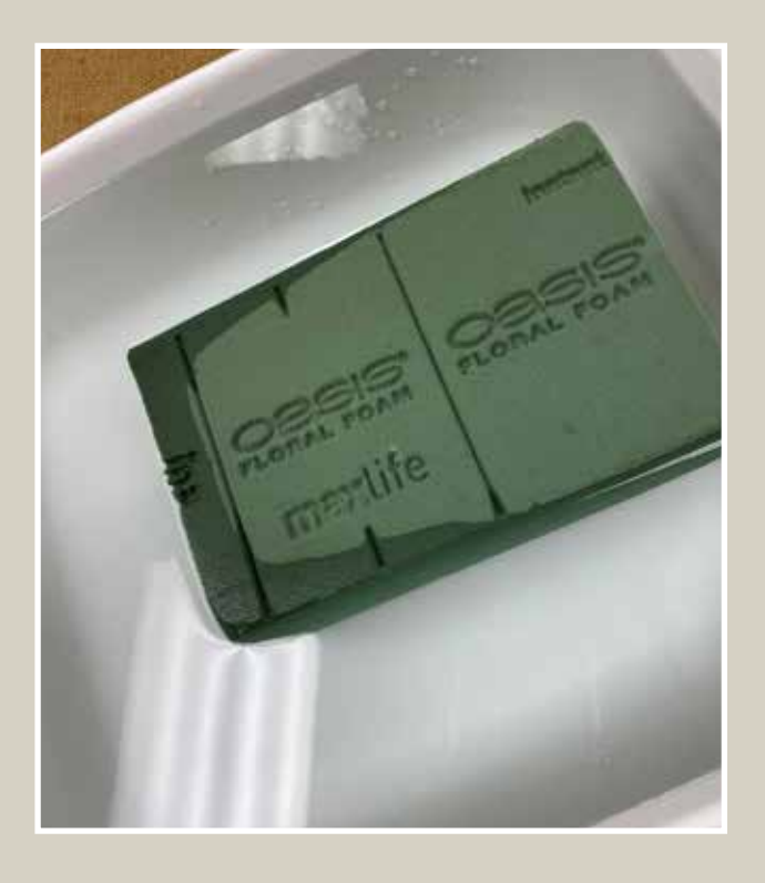
Do not force the brick below the water line. It takes the foam less than 1 minute to fully hydrate.

When it has taken up the maximum amount of water, it will float just beneath the surface of the water. Note: The depth of the water must be greater than the height of the foam. Otherwise, the foam may not fully hydrate, and pockets of air may remain inside the brick.