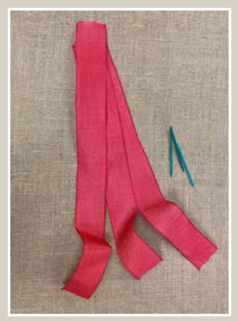
First, cut the ribbon into three 24-inch lengths.