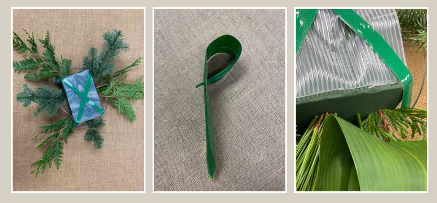
Add more foliage at this level, resting on the rim of the container and touching the tabletop.