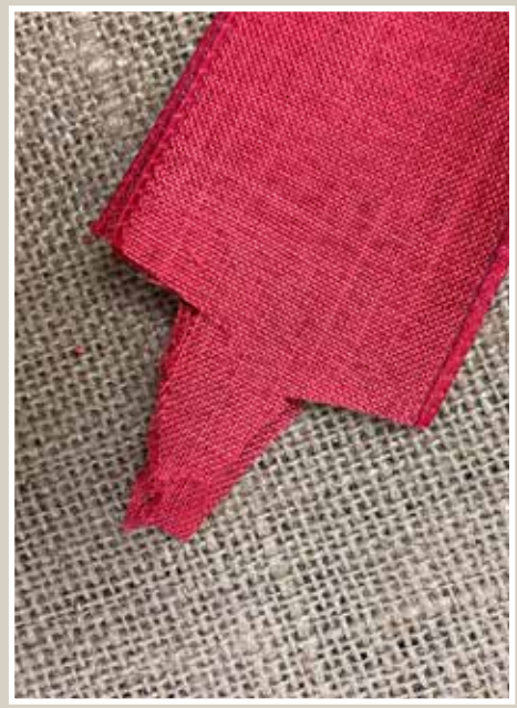
Cut the ribbon at the end of the S where the curve and an end meet, making two notches on the sides.