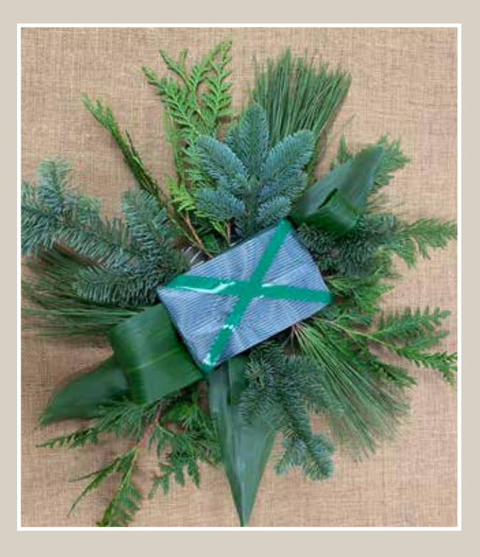
Continue making placements in order to achieve a circle of greenery, concentrating on the base of the foam and covering the plate.