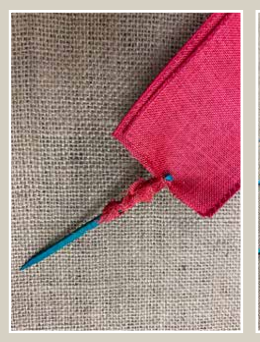
Use a wired wood pick to hold this notched area tightly in place.