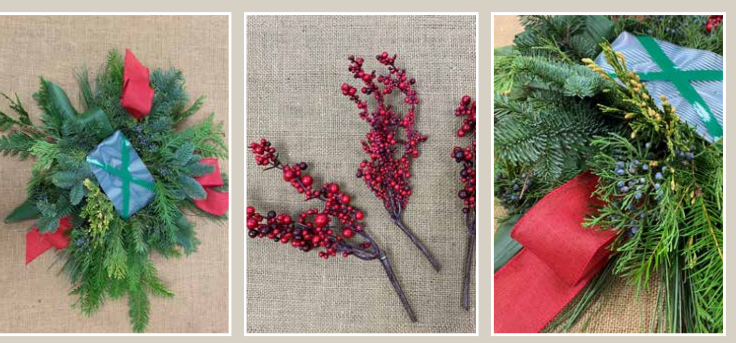
Add the ribbon loops in a triangular pattern.