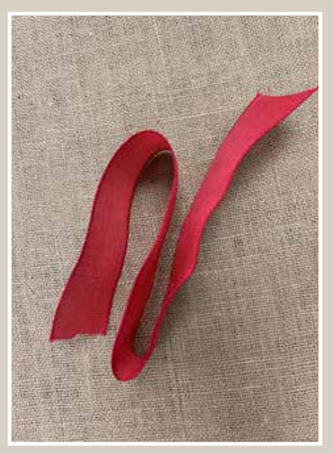
Fold the ribbon so that it follows an S shape.