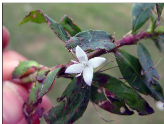
Figure 2. Virginia buttonweed's characteristic white, four-petaled flower.