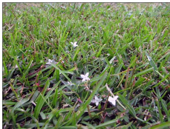
Figure 1. Virginia buttonweed in centipedegrass.

The sulfonyleurea herbicides, such as chlorsulfuron, metsulfuron, and trifloxysulfuron, are also very effective at extremely low use rates. In trials at Mississippi State