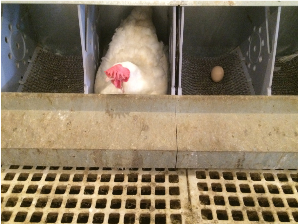
Figure 2. Check nests often for eggs that may not have rolled onto the belt.

One of the most important aspects of producing good-quality hatching eggs is to educate yourself and your employees on proper egg collection and storage techniques. If everyone involved in egg handling is not familiar with the proper procedures for producing good-quality hatching eggs, poor egg quality will result. Remember that a good-quality egg usually means a good-quality chick.