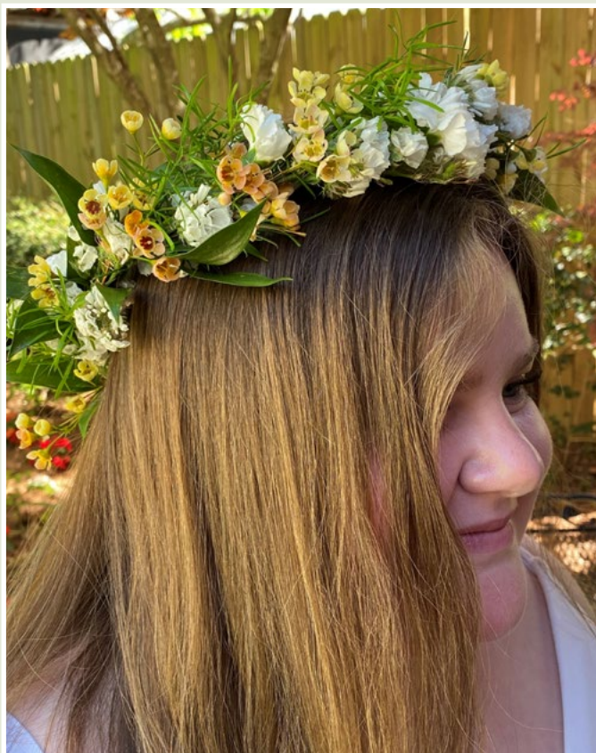
A flower crown.