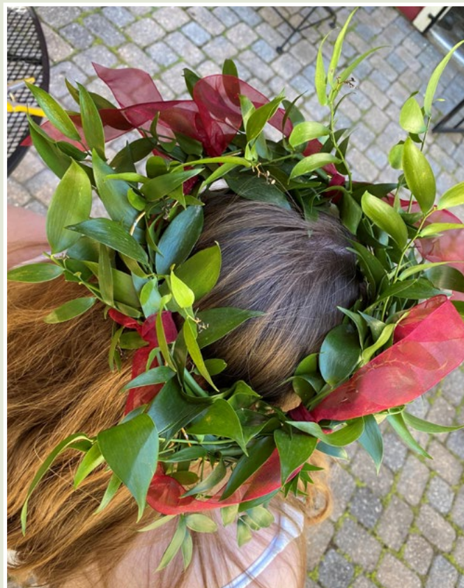
A laureate's crown of Italian ruscus and red ribbon.