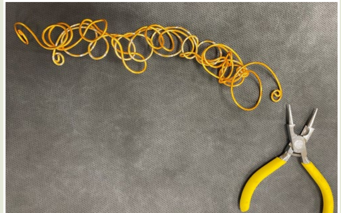
Top photo: Various materials needed for the grad bracelet project are displayed, including ribbon, wire and floral adhesive. Bottom photo: Floral wire is bent into swirls.