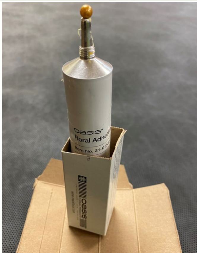
A partially opened tube of cold glue sits in a cardboard holder.