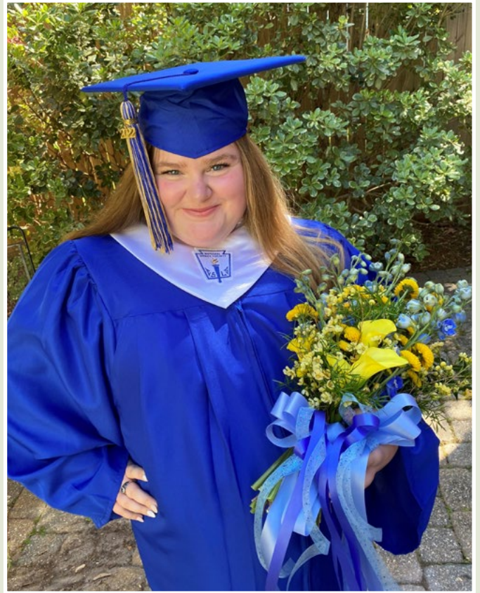
Graduates love receiving their special floral bouquet!

Promote the use of flowers in everything that you do! Give flowers as gifts; they are the perfect way to say, "Way to go, grad!" Pure hues of school colors will reflect beautifully for outdoor commencements, parties, and photo shoots, and the recipient will not want to part with them. You can sell them with the cost of a vase included to avoid the need for water tubes. In this way, the bouquet can be used as a party decoration, too. Choose line flowers to accompany the mass and filler flowers to create an elongated arrangement that is held in the crook of the arm. Add playful ribbons to catch the breeze.