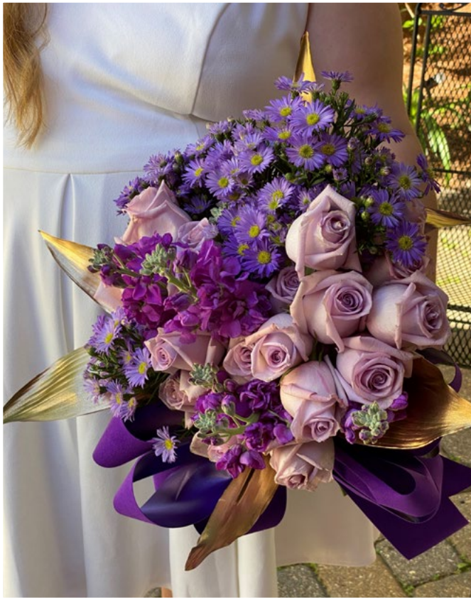
A robust bouquet features a variety of flowers in multiple colors.