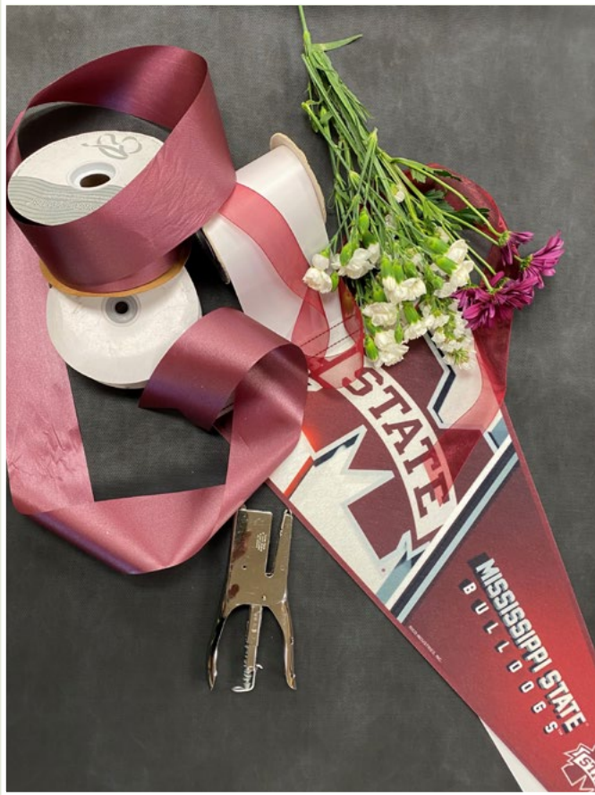
Materials for a decorative pennant include various ribbons, a school pennant, fresh flowers, and a stapler.