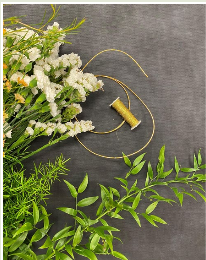
Our flower crown features Italian ruscus, asparagus fern, white statice, yellow-tinted waxflower, and miniature carnations.