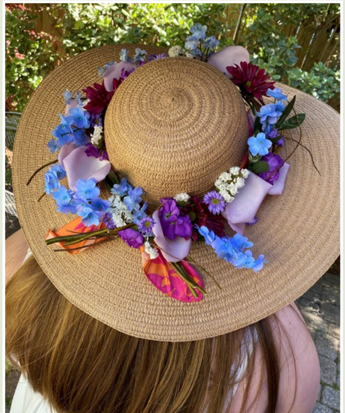
A summery mixture of permanent and fresh flowers gives our graduate a fun prop for photos and for outdoor parties.