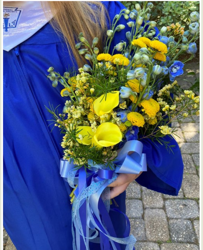
School colors stand out from the crowd when customers "say it with flowers"!