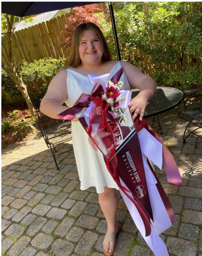
Many different types of accessories can adorn a book, and designing is so simple!