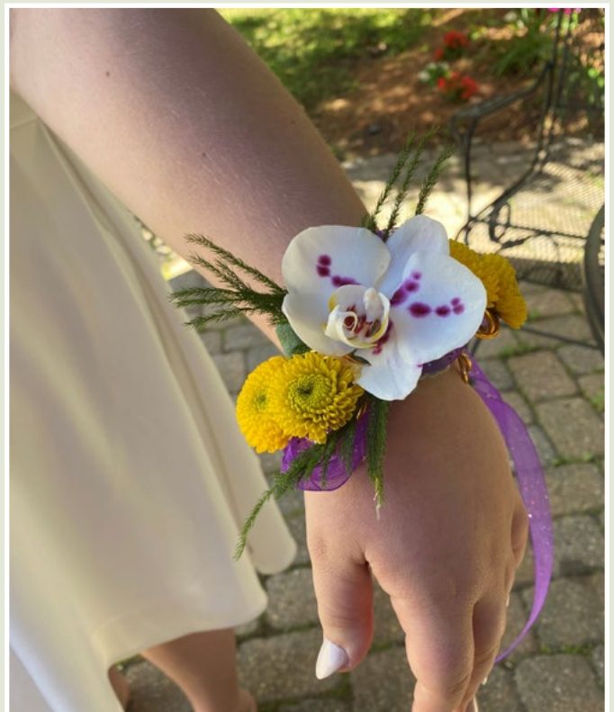
This wire base easily adapts to the wearer's wrist with a few squeezes.