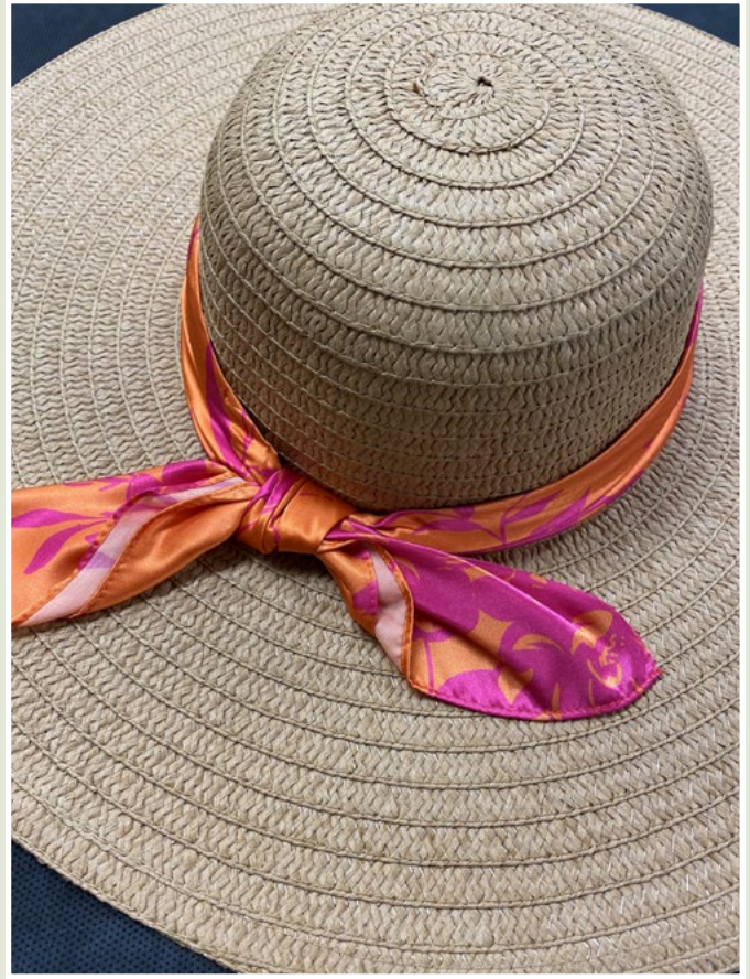
Straw sunhats are the perfect prop for springtime photo shoots.

Once the willow was attached to the scarf via paper-covered wire, we glued silk and fresh flowers to the framework and fabric. Our roses were too bulky for the design, so we attached their petals to add the soft lavender color. Coat the fresh materials with anti-transpirant spray.