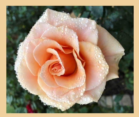
Figure 1. A single-stem hybrid tea rose.

Show roses generally take more care and attention than roses planted to enhance the garden or landscape. The objective of growing show roses is to attain large, symmetrical blooms balanced with glossy green foliage either on single stems (standards, Figure 1) or in sprays (Figure 2). Show rose judging is accomplished using a point system, with 75 percent weighted to the bloom quality and 25 percent to the foliage. When two or more blooms receive identical scores, judges may use subjective means to determine winners.