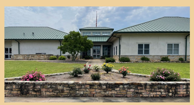
Figure 6. Grandiflora and floribunda roses need at least 3 feet between them.