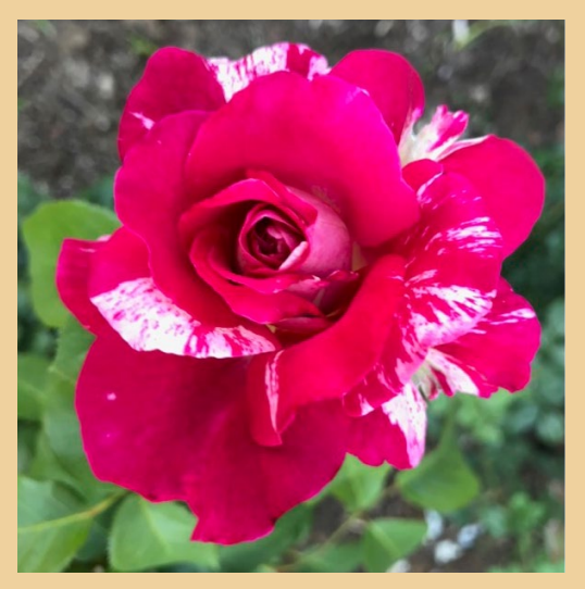
Figure 8. Neil Diamond hybrid tea rose.

Show rose pruning may begin in February or March, depending on your location in the state and on the weather patterns. Show roses are pruned to two standard lengths: 18 inches for fewer but bigger blooms, or 24 inches for more but smaller blooms. This recommendation is specific to hybrid teas (Figure 8) since floribundas and grandifloras have a more bush-like shape and clustered flowers, which generally results in shorter stems. Other rose classes have different pruning techniques depending on their size, shape, and bloom type.