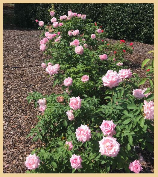
Figure 5. Hybrid tea roses can be planted more closely together than grandiflora or floribunda roses.

Measure the beds to determine how many roses to purchase. Most show roses need at least 3 feet between them and other plants or structures to produce quality blooms. This can vary based on the class of roses planted. Hybrid teas, for example, are more upright than grandifloras or floribundas and can be planted closer (Figures 5 and 6). Decide before making purchases if you want to focus on one type of rose and its cultivars or on a mixed class of rose bushes.