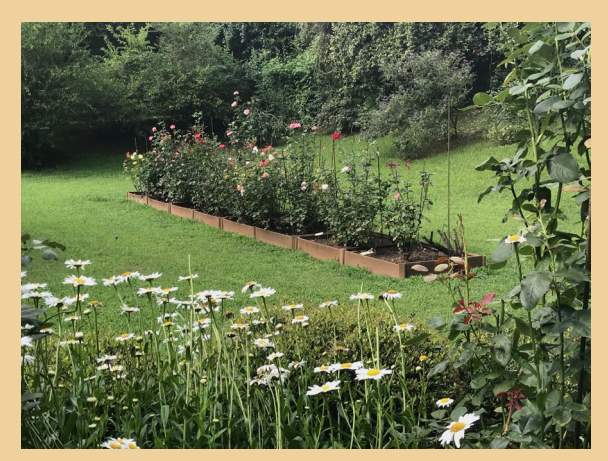
Figure 4. Roses growing in a raised bed.

Next, decide whether the roses will grow directly in the ground (native soil), in raised beds, in containers, or a combination of these. Each method requires different soil preparation. In-ground planting may require soil amendments based on the type of soil present. Add only the soil amendments that are needed to improve the site. Raised beds generally follow the three-part mix of equal amounts of soil, sand, and compost (Figure 4). Pots or containers are usually filled with high-quality potting soil or a three-tiered mix, depending on the size of the pots.