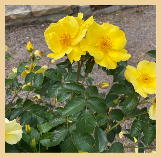
Figure 2. A rose in a spray.

Fall is the optimum season for preparing a new rose garden. Once prepared, the site can remain idle until spring planting time arrives. This also allows time for fall soil