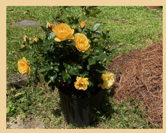
Figure 3. A rose plant grown in a container.

(Figure 3) ranging from 4 inches in diameter to 5 gallons. They are also sometimes grown and packaged in plastic bags.