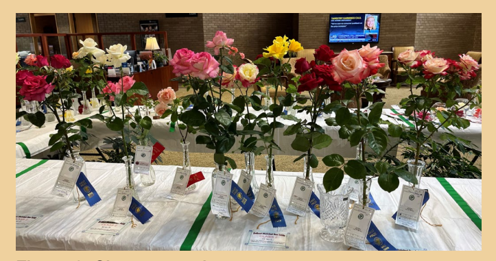
Figure 9. Show rose winners.

cut, especially if they are in a class to be fully open and showing the stamen. Cut roses the day before the show and place them in water-filled containers. Make sure the thorns do not tear foliage or flowers. Cut these flowers with a longer cane than needed for exhibition staging, then do a final prune when placing them into the show vase (Figure 9).