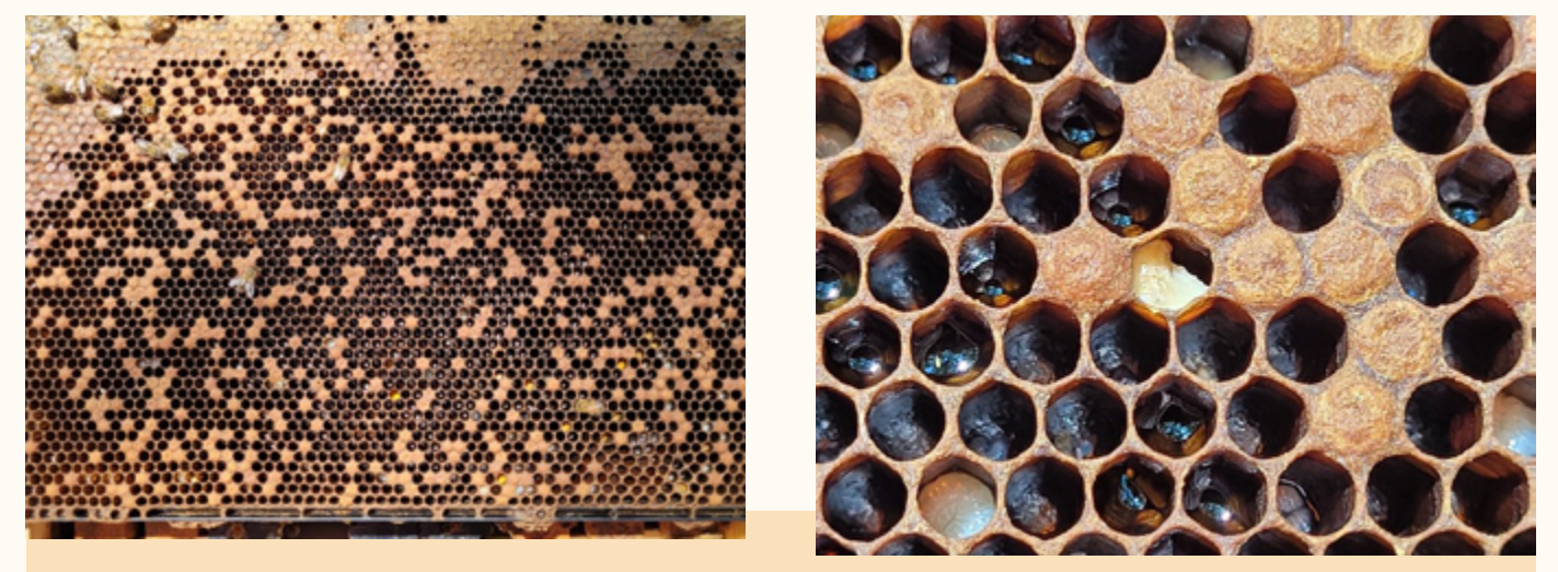
Figure 3. Combs from colonies 2 and 3 that were installed in Greenwood also had very spotty brood patterns and obviously sick larvae.

The four sick colonies were treated with Apivar to try to kill the mites and save the bees. Apivar was chosen because the active ingredient is amitraz, which is known to have high kill rates and low residual time in beeswax, and its toxicity is not dramatically changed by summertime temperatures (see MSU Extension <u>Publication 2826 Managing Varroa Mites in Honey</u> <u>Bee Colonies</u>). Additionally, it was used to provide a continuous source of miticide for 45 days. The Honey Bee Health Coalition offers a more thorough discussion