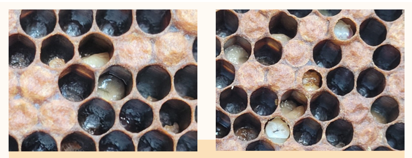
Figure 2. Sick bee larvae and uncapped pupae on brood combs from colony 6 (Table 1) that was installed in Tupelo. This colony had a mite load that was just below the 3 percent economic threshold, but it already had a spotty brood pattern with dying larvae visible on the combs.