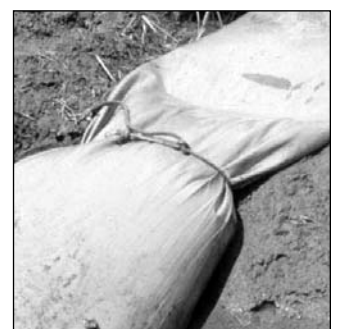
Choke rope on tubing