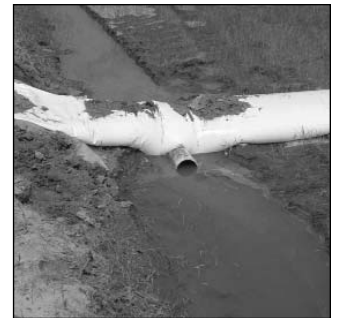
Culvert pipe under tubing