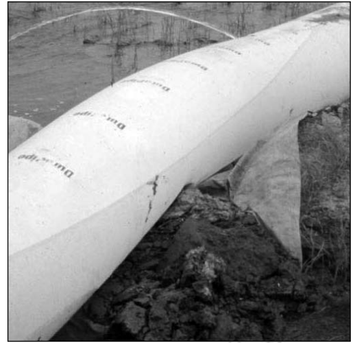
Air pocket in tubing

Adjustable 2.5-inch diameter slide gates and/or holes are placed in the tubing for water inlets to each levee that the tubing crosses. Gates and/or holes should be placed near the top side of the tubing at 11 or 1 o'clock position. They can be placed anywhere between the levees but when placed closer to the upper levee, the tubing will hold more water when not irrigating and be less likely to float or move. The holes or gates are adjusted when flooding the field so that each levee floods up at about the same rate. Most growers find that after the initial adjustments they don't have to spend as much time with the water management as they do with most fields that are flooded conventionally. Additional adjustments during the season may be necessary if the flow to the field changes significantly as is possible with pipeline systems that have several wells and multiple pumping outlets. It is important that small relief holes be punched in air pockets that form in the tubing. Air pockets restrict the water flow through the tubing and can become a hot spot where the tubing may stretch, become thin, and possibly rupture.