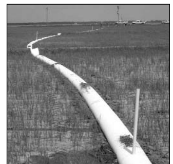
PVC pipe in tubing