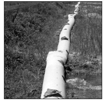
Tubing in field

In many installations it may be advisable to size down to the next smaller size tubing after covering a significant amount of the field. An example would be to start with 15-inch tubing for a 2,000 gpm flow but go to 12-inch once half of the field has been covered and the flow is probably 1,000 gpm or less. When the flow in the tubing doesn't keep it rounded, gates and/or holes may not flow fully and the tubing may flap enough to cause it to tear. The flapping is more likely to be a problem on steeper fields and on the downslope side of levees. Proper-sized tubing can help reduce this problem but it may be necessary to use rope or strapping to restrict the tubing at a point below where it continues to flap against itself.