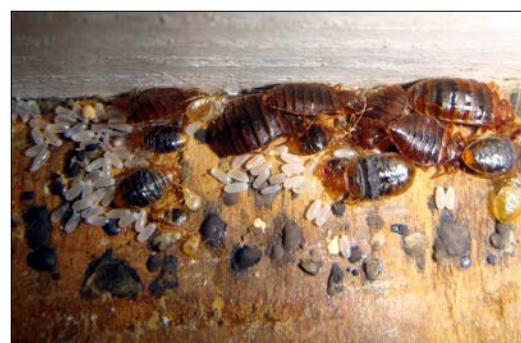
Figure 2. Adult bed bugs, nymphs, and shell casings.

The life cycle of the common bed bug consists of the egg, five stages of nymphs (each progressively larger than the preceding), and adults (Steelman, 2000) (Figure 2). Each immature nymph stage must take a blood meal in order to develop into the next stage. Like all insects, bed bugs have their skeleton on the outside of their bodies (exoskeleton) and, therefore, must shed their exoskeleton in order to grow larger (Miller and Polanco, 2013). Adult bed bugs must also take regular blood meals to reproduce. Adult bed bugs are reddish-brown in color, while the nymphs and eggs are yellowish-white.