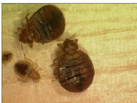
Figure 1. Bed bugs have been around for thousands of years and are making a comeback.

The common bed bug ( Cimex lectularius L.) is a hematophagous (feeds on blood) insect that can be a major pest in poultry breeder facilities. Several other species exist and are occasionally important, including the bat bug ( C. pilosellus ), the barn swallow bug ( Oeciacus vicarius ), and the poultry bug or Mexican chicken bug ( Haematosiphon inodorus ) (Roe, 2000). However, the common bed bug is the most often-encountered species. Bed bugs belong to a family of insects called Cimicidae. Members of this insect family are small, oval, flat, hard-bodied, flightless insects in which the wings are absent or reduced to stubs (Figure 1). All members of this family of insects feed exclusively on blood.