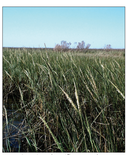
Spartina alterniflora meadow