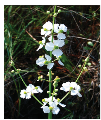
Sagittaria lancifolia female flowers