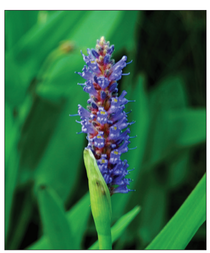
Pontederia cordata inflorescence