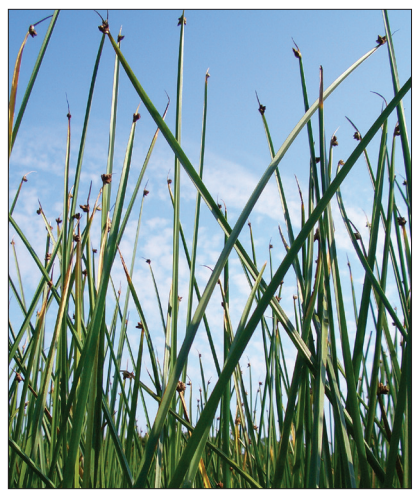
Schoenoplectus americanus stand