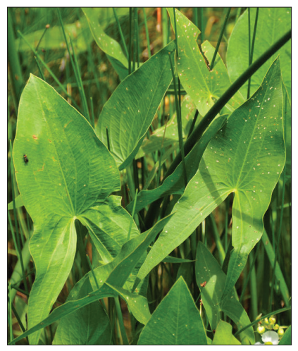
Sagittaria latifolia leaves