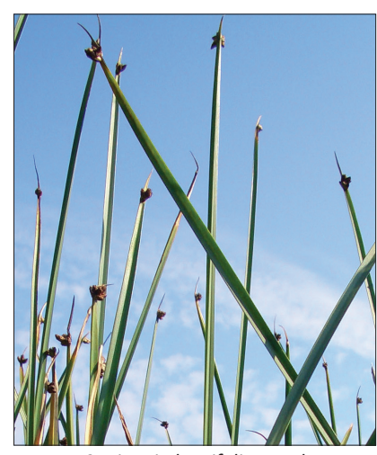
Sagittaria lancifolia stand