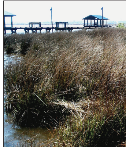
Juncus roemerianus meadow