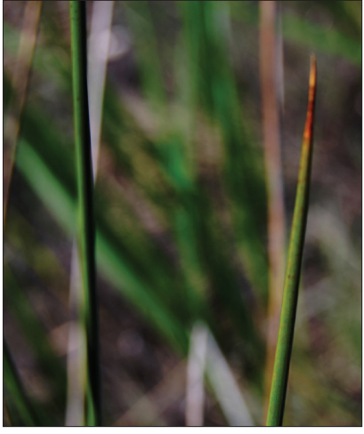
Juncus roemerianus stem