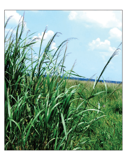
Panicum amarum in a marsh