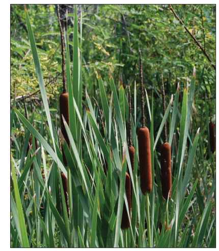
Typha latifolia inflorescence