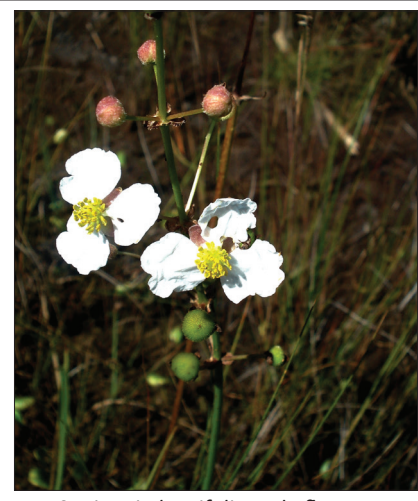
Sagittaria lancifolia male flowers