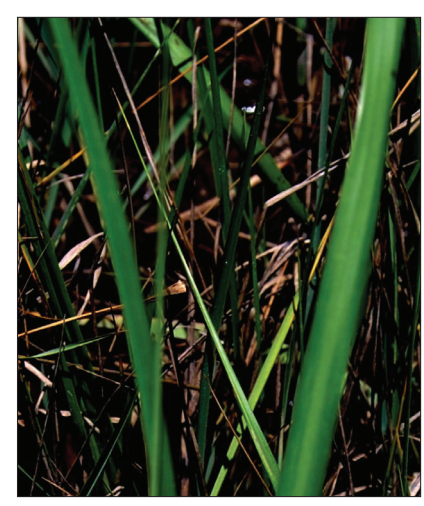
Uniola paniculata inflorescence