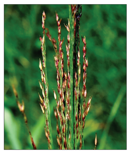
Panicum amarum inflorescence