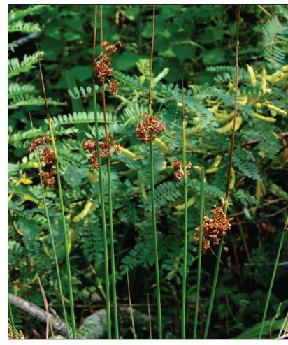
Juncus effusus stems