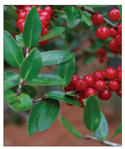
Ilex vomitoria leaves