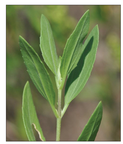
Iva frutescens leaves