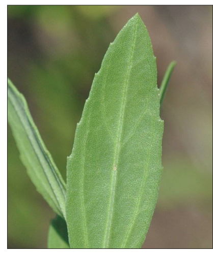
Iva frutescens leaves