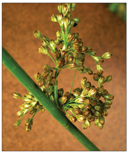
Juncus effusus inflorescence