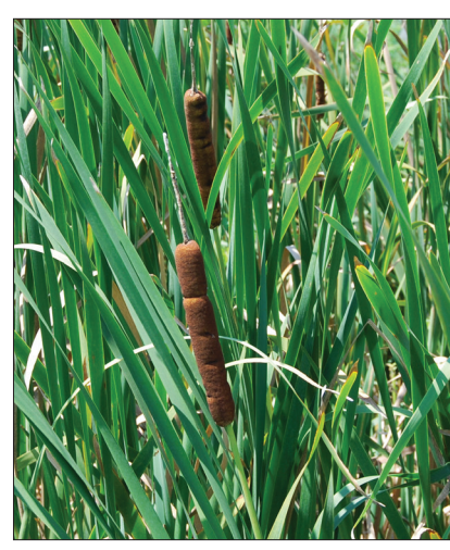
Typha latifolia inflorescence