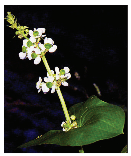
Sagittaria latifolia inflorescence