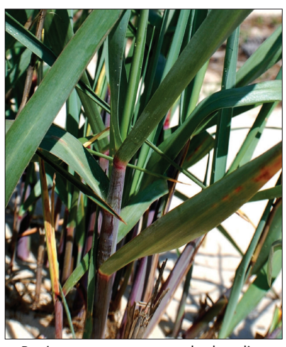
Panicum amarum on sandy shoreline