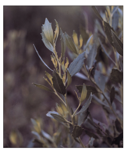
Baccharis halimifolia leaves