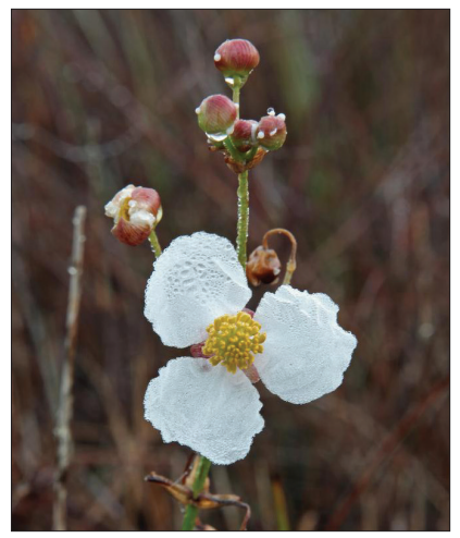
Sagittaria latifolia inflorescence