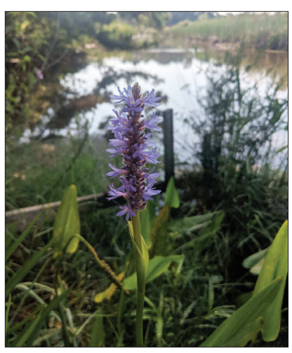
Pontederia cordata inflorescence