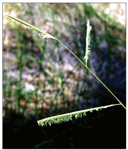
Spartina patens inflorescence