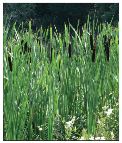
Typha latifolia stand