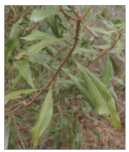
Myrica cerifera leaves