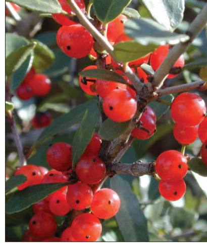
Ilex vomitoria fruit