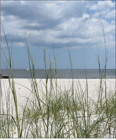
Uniola paniculata stand