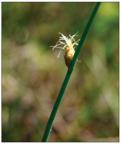
Schoenoplectus americanus inflorescence