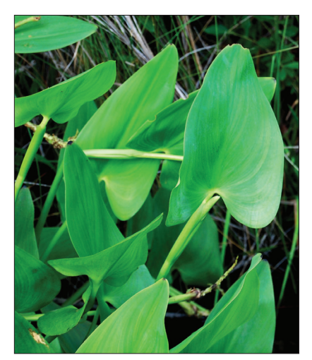
Pontederia cordata leaves