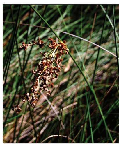
Juncus roemerianus inflorescence