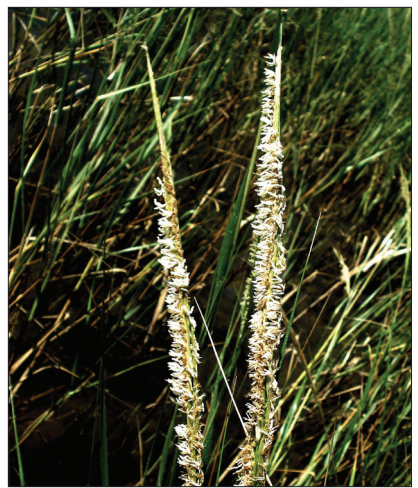
Spartina alterniflora inflorescence