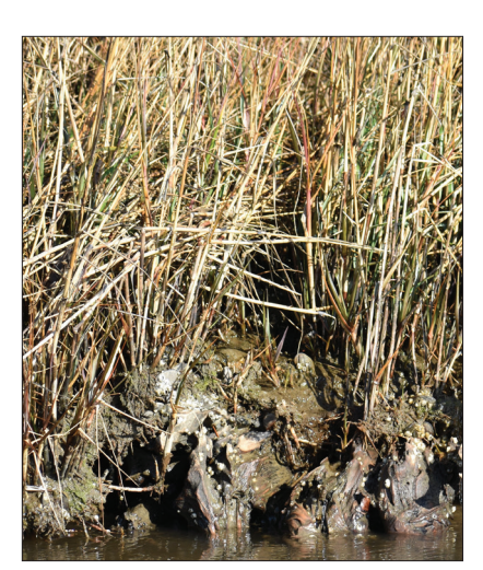
Spartina alterniflora in winter