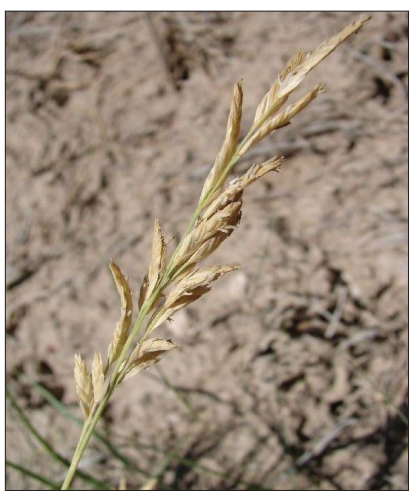
Distichlis spicata inflorescence