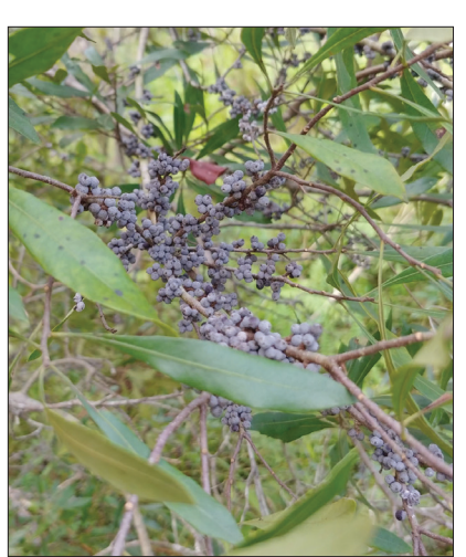
Myrica cerifera fruit