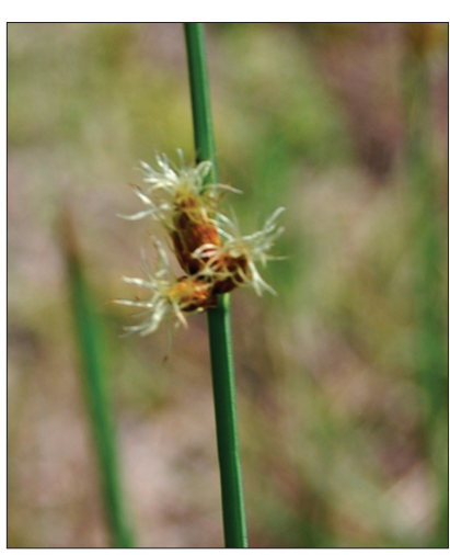
Schoenoplectus americanus inflorescence

Scientific name: Schoenoplectus americanus