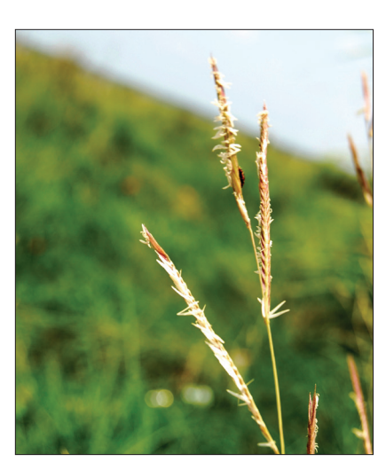
Spartina patens inflorescence