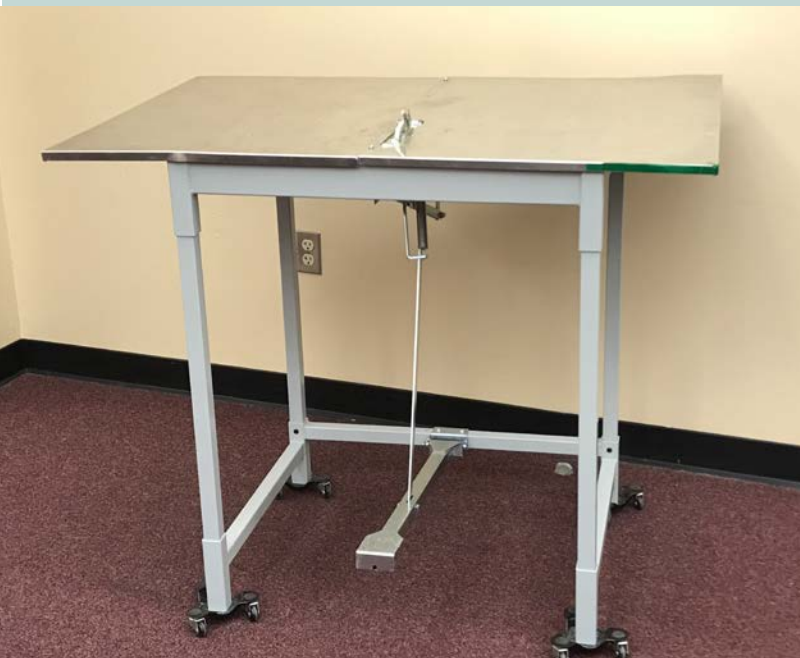
Figure 3. A pedal-operated clamp mechanism attached to a work table is the best practice for commercial producers.