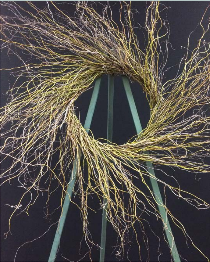
Figure 4. This wreath has a 40-inch outside diameter and weighs 1.78 pounds. It takes about 30 minutes to construct using a clamp machine and associated clamp wire form. It is made of Salix matsudana 'Koidzumi' branches approximately 28 inches long.

Purchasing the materials to make this design from a wholesale florist would cost around $50. Our study found consumers are willing to pay much less than that figure, on average around $22.50. Still, if using willow grown on the farm, input costs are significantly lower, allowing you to sell this wreath and maintain a profit. For farmers who sell to florists, retailers can add value to the design through the addition of silk or dried flowers, increasing the wreath's value and, accordingly, retail price.