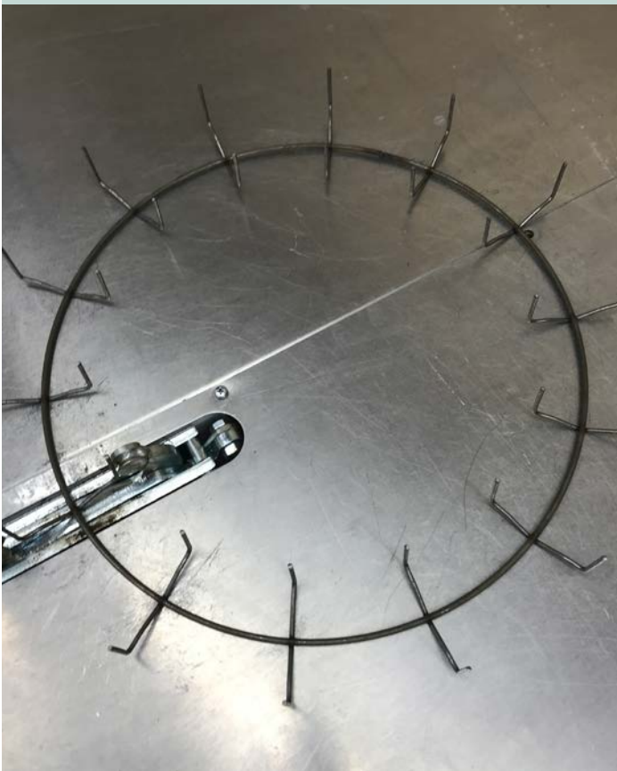
Figure 1. Clamp wreath forms are manufactured in various sizes.

machine uses force to clamp the prongs around the bunch, holding it tightly in place. The clamping action is triggered by a foot pedal, leaving hands free to hold materials in place. Having the clamp mechanism permanently attached to a table is the best practice for commercial producers and a good choice for producers entering the wreathmaking marketplace.