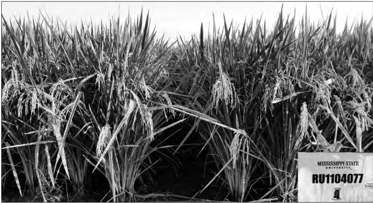
Figure 1. Upcoming conventional variety release: RU1104077.

comparing the highest-yielding hybrid to the highest-yielding purelines. The continued good performance of Rex relative to the highest-yielding hybrid should help in further increasing its acreage in the future. In 2013, Rex became the most popular conventional pureline in Mississippi, occupying roughly 15% of the state's total rice area.