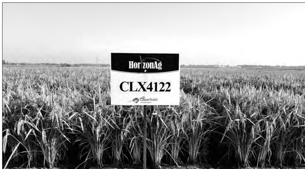
Figure 2. Upcoming Clearfield® variety release: RU1104122 (CL163).

As has been demonstrated in previous years, no variety or hybrid is perfect. Each variety that is released has qualities or characteristics that add value to the marketplace. Varietal performance over time and in different environments should be considered when choosing which variety to plant. For varieties with high yield potential, consider risks such as lodging and disease and plan to manage for those yield-limiting factors. Multiple varieties, both Clearfield® and conventional, are recommended for average-sized rice farms to further spread the risks associated with rice production.