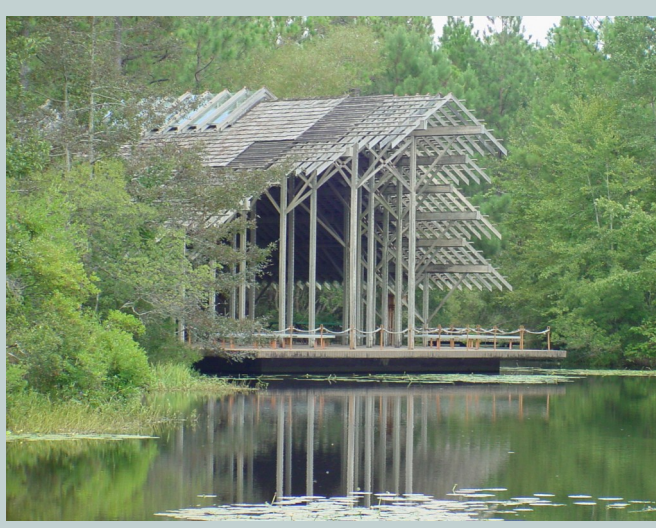
Pinecote Pavilion at Crosby Arboretum, MSU-ES